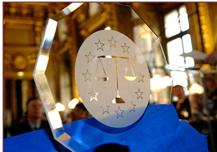
(Judicial Hub 2015, Winner of the Council of Europe Crystal Scales of Justice Award)

To a certain extent, this was a successful strategy for the new Institute in its first years and it allowed us to display clear ambition from the outset. We piloted and established a number of highly successful initiatives. These include online resources and a full range of online, blended and face to face learning. All learning is now managed through our online learning platform, 6 the award-winning Judicial Hub, and we continue to build on these initiatives. The judiciary are content with our offering. However, as more fully outlined later in this document, we believe it is important at this stage of the Institute's existence to more formally explore their views on all aspects of the Institute and their learning experience, through the 2019 and 2021 Judicial Attitudes Surveys.