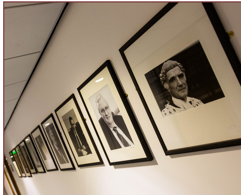
(Pictures depicting some of the former leaders of the Judicial Institute).