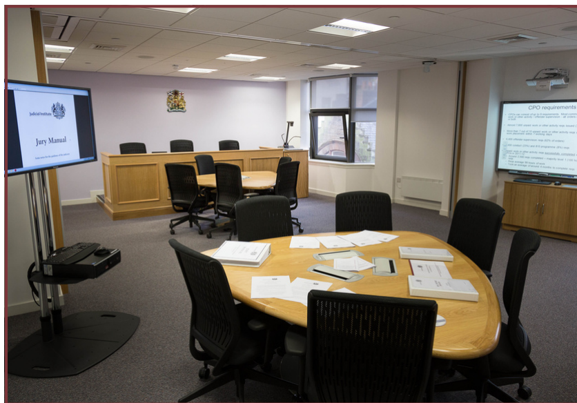
(The learning suite at Parliament House set up for a course).