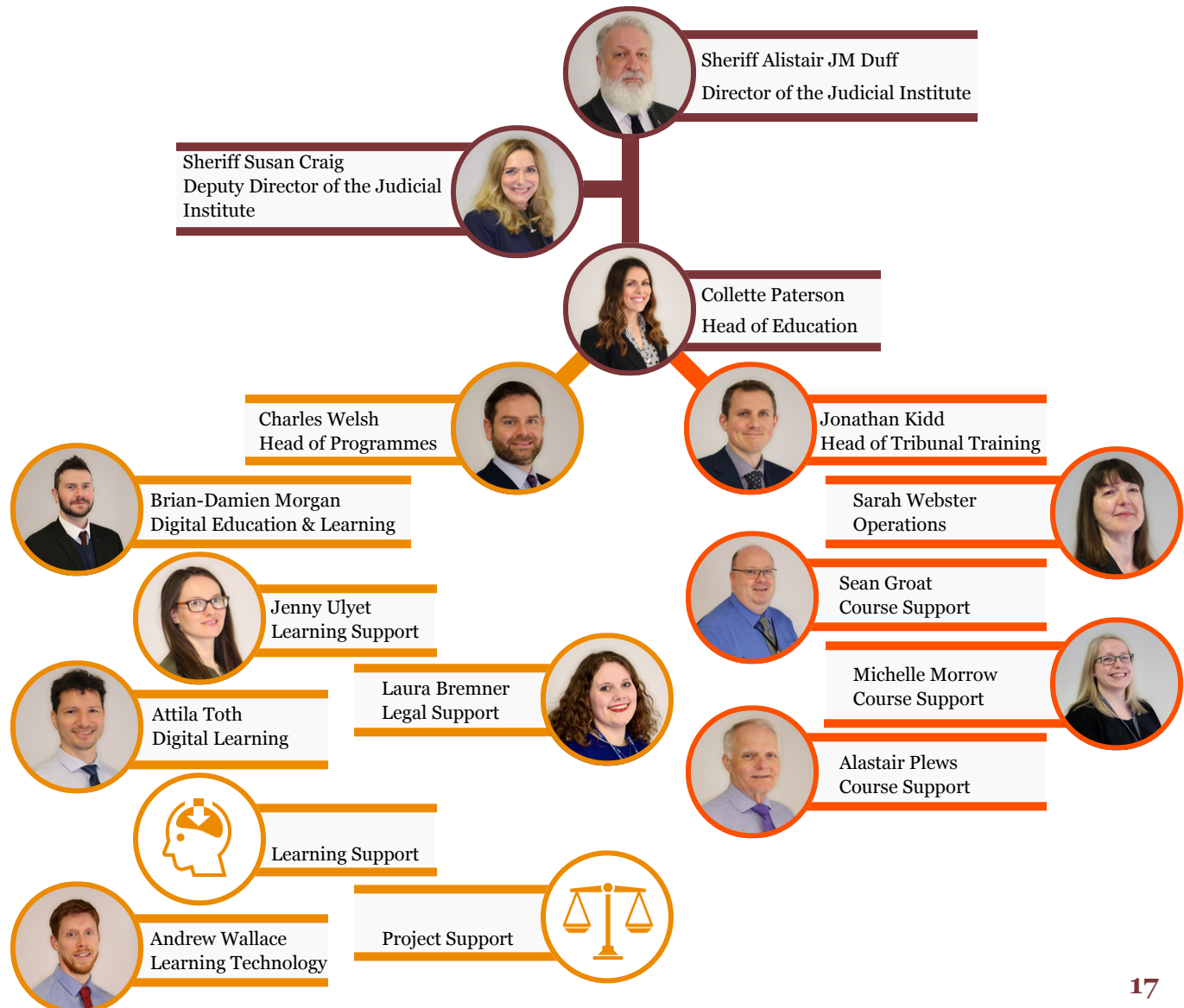
Figure 3 – Operational structure (Judicial Institute Board not represented)

The Head of Education supports the Director and Deputy Director day to day and oversees a team of 14 officials to execute the Board’s requirements. We commenced a restructure of the Institute in 2016. We created four specialist job roles in education and digital areas, which allows us to attach a hands-on education and digital adviser to each of our face to face courses and more generally ensure the right levels of expertise are correctly deployed in all of our projects. We created a Head of Programmes post in 2018, which is a hands-on senior post which oversees the quality of our portfolio.